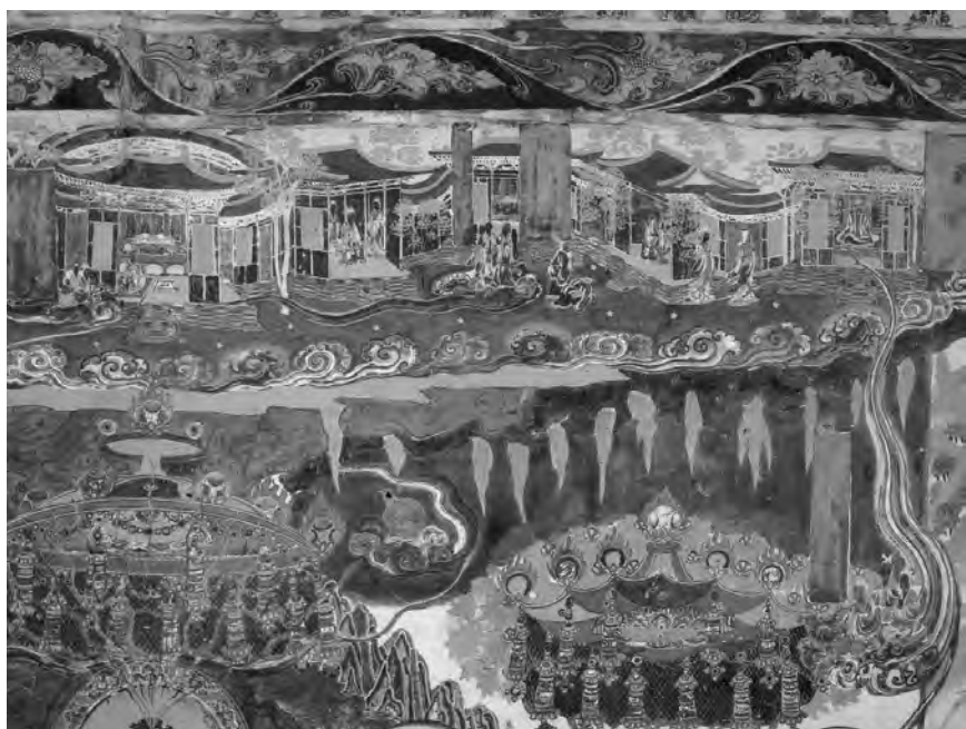
Figure 3.4 Top section of the Lotus Sūtra tableau, Mogao Cave 217. South wall, Mogao Cave 217. Early eighth century.