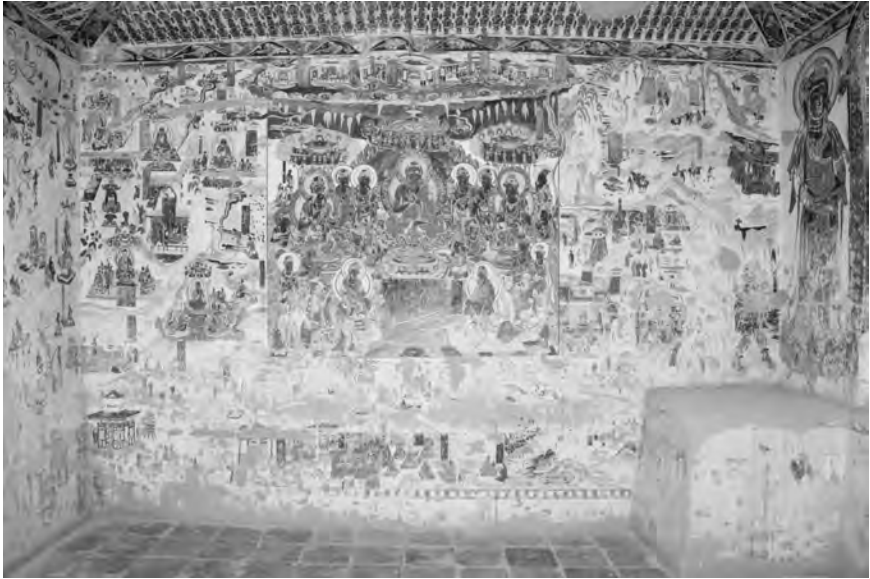
Figure 3.1 Transformation tableau based on the Lotus Sūtra. South wall, Mogao Cave 217. Early eighth century.