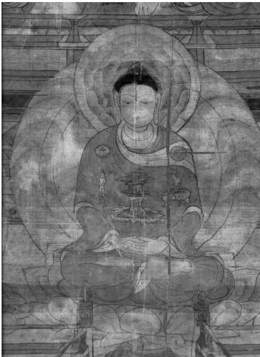
Figure 3.7 Mt. Sumeru on the robe of the Vairocana image. Detail of transformation tableau based on the Recompense Sūtra. Eighth century. British Museum.