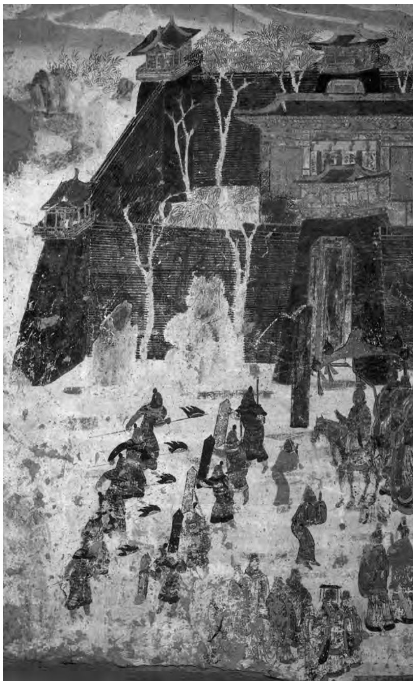
Figure 3.9 Left side of the transformation tableau based on the Visualization Sūtra. North wall, Mogao Cave 217. Early eighth century.