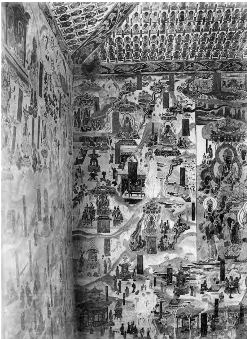
Figure 3.3 Left side of the Lotus Sūtra tableau, Mogao Cave 217. South wall, Mogao Cave 217. Early eighth century.