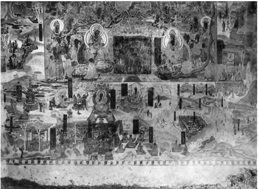
Figure 3.2 Bottom section of the Lotus Sūtra tableau, Mogao Cave 217. South wall, Mogao Cave 217. Early eighth century.