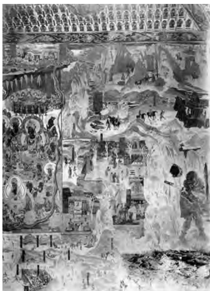
Figure 3.5 Right side of the Lotus Sūtra tableau, Mogao Cave 217. South wall, Mogao Cave 217. Early eighth century.