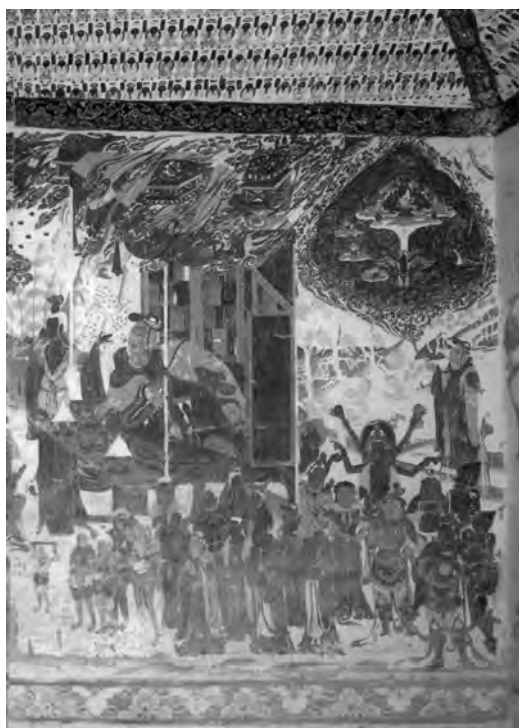
Figure 3.6 Mt. Sumeru-centered cosmos moved by Vimalakīrti. Detail of transformation tableau based on the Vimalakīrti-nirdeśa-sūtra. North wall of Mogao Cave 335, Dunhuang. End of seventh century.