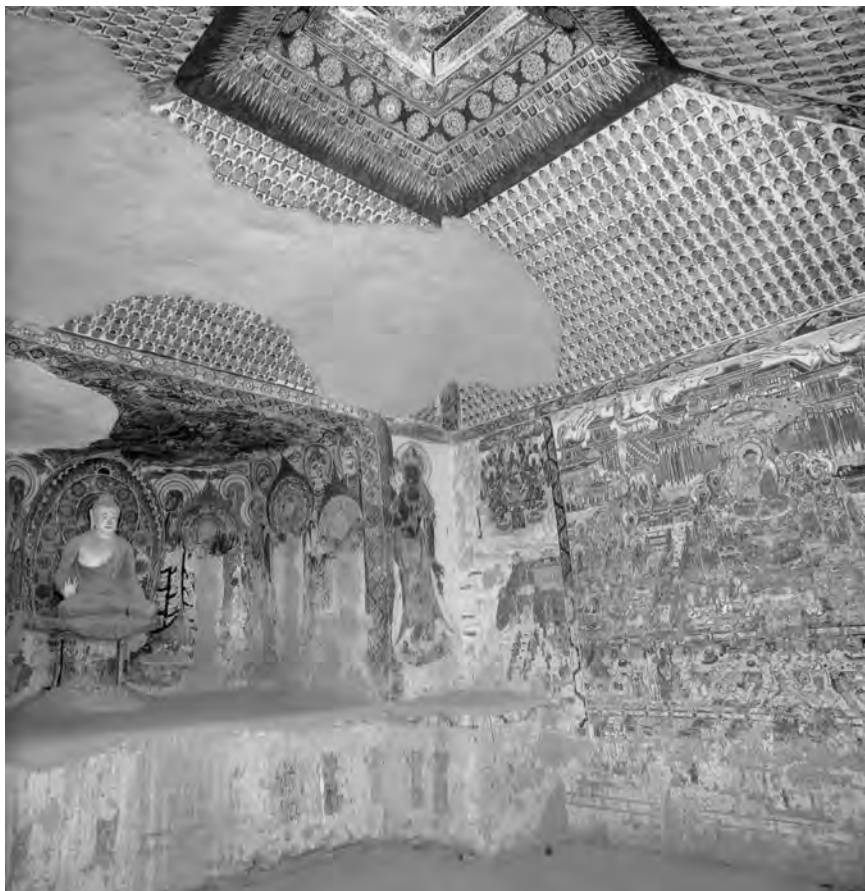
Figure 3.8 View of the west-wall niche to the left; and north wall to the right showing the transformation tableau based on the Visualization Sūtra. Mogao Cave 217. Early eighth century.