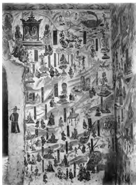
Figure 3.10 Tableau based on the Guanyin chapter of the Lotus Sūtra. East wall, Mogao Cave 217. Early eighth century.