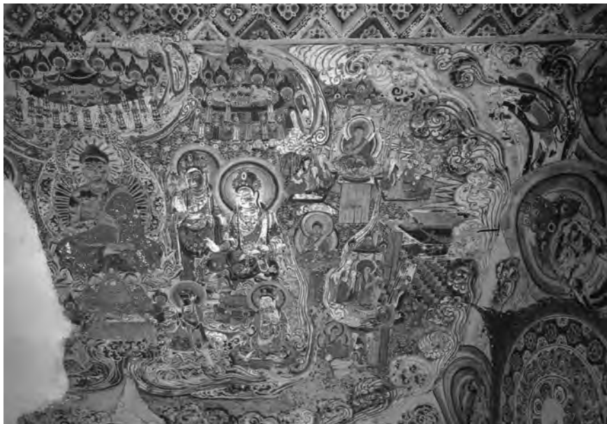
Figure 3.11 Śākyamuni ascends to Heaven of the Thirty-Three Celestials (Trāyastriṃśa) to preach for his mother Māyā. Painting on the ceiling of the west wall niche, Mogao Cave 217. Early eighth century.