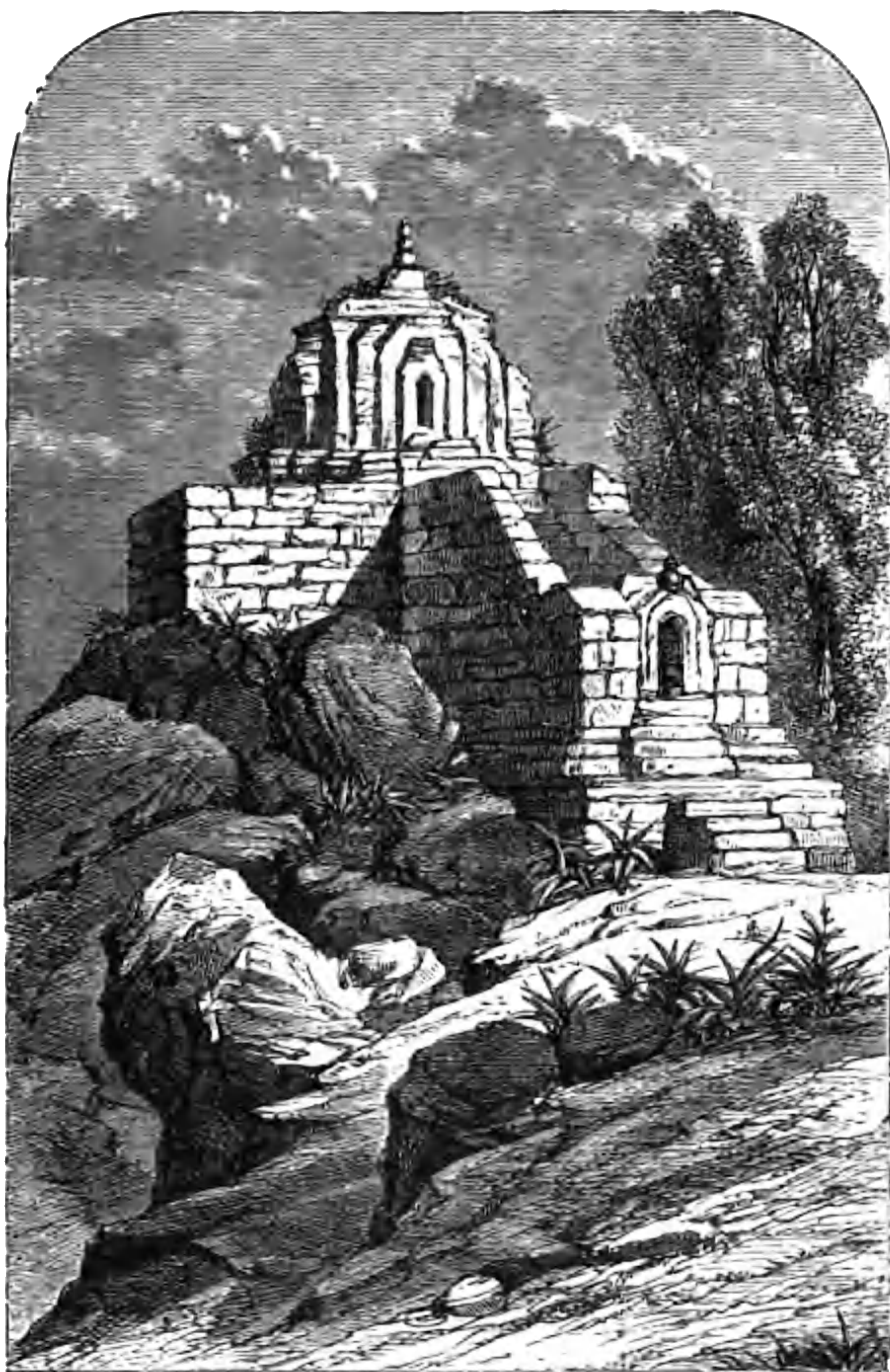
SOLOMON'S THRONE.—See page 40.