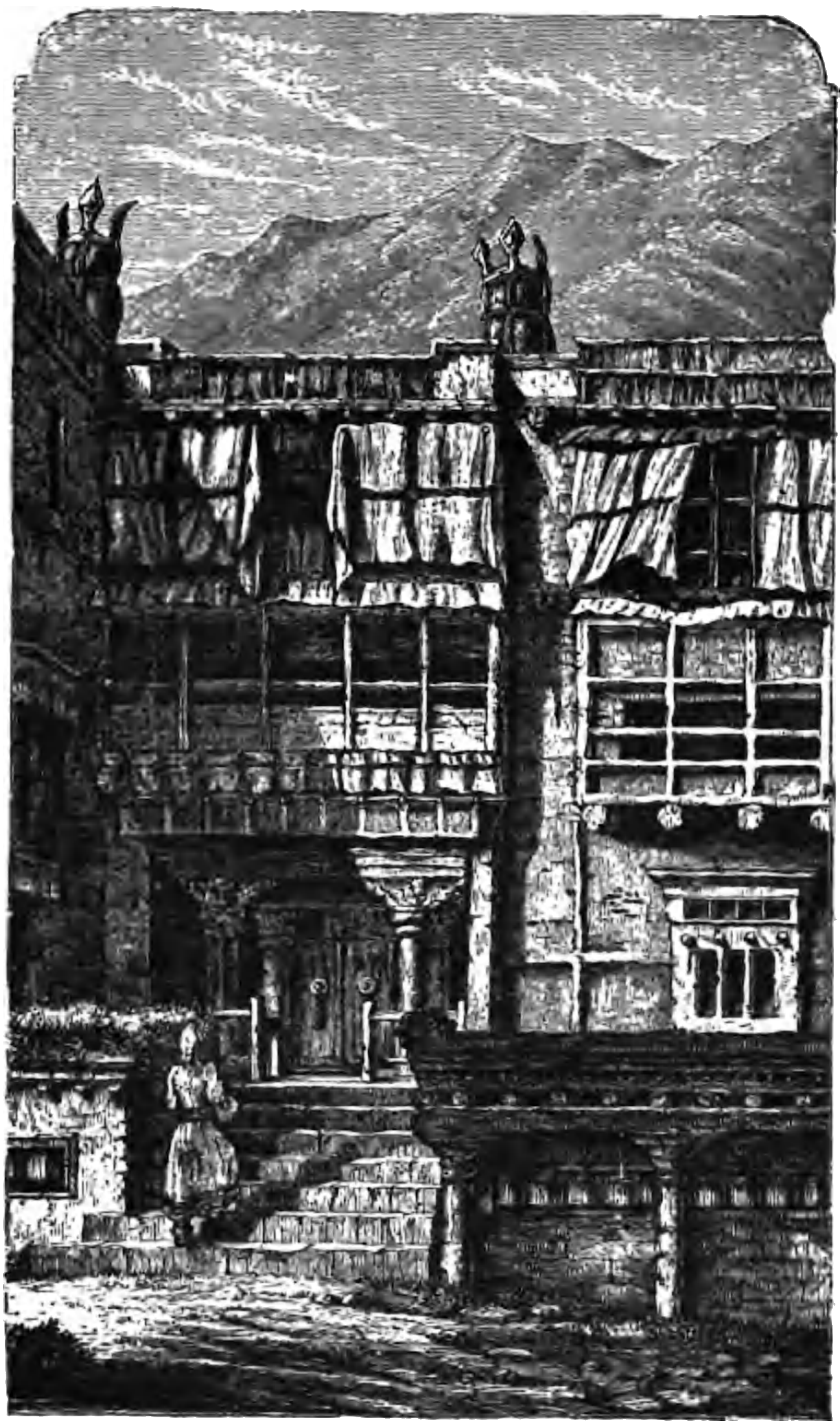
THE HIMIS MONASTERY.