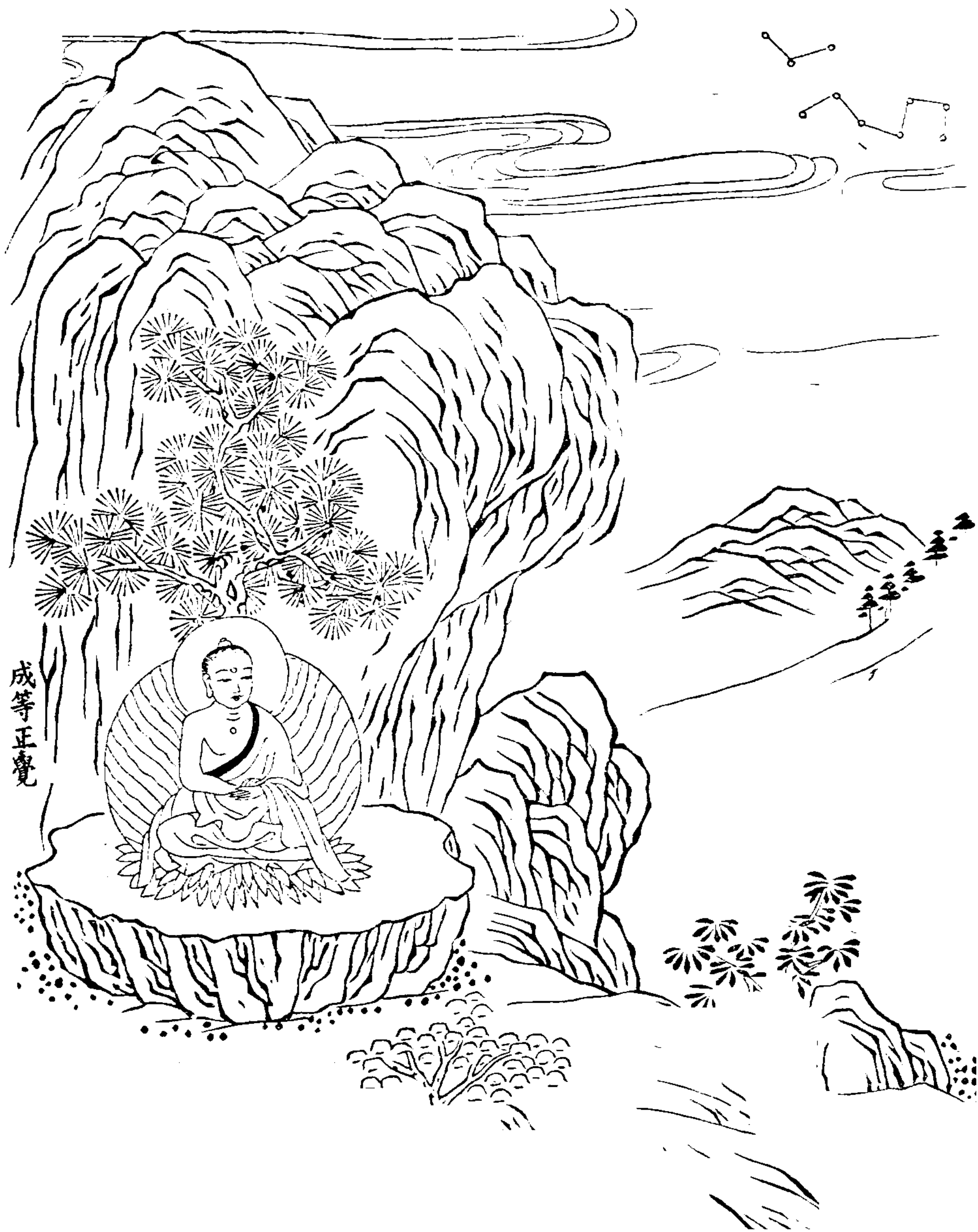
V. BUDDHASHIP ATTAINED.