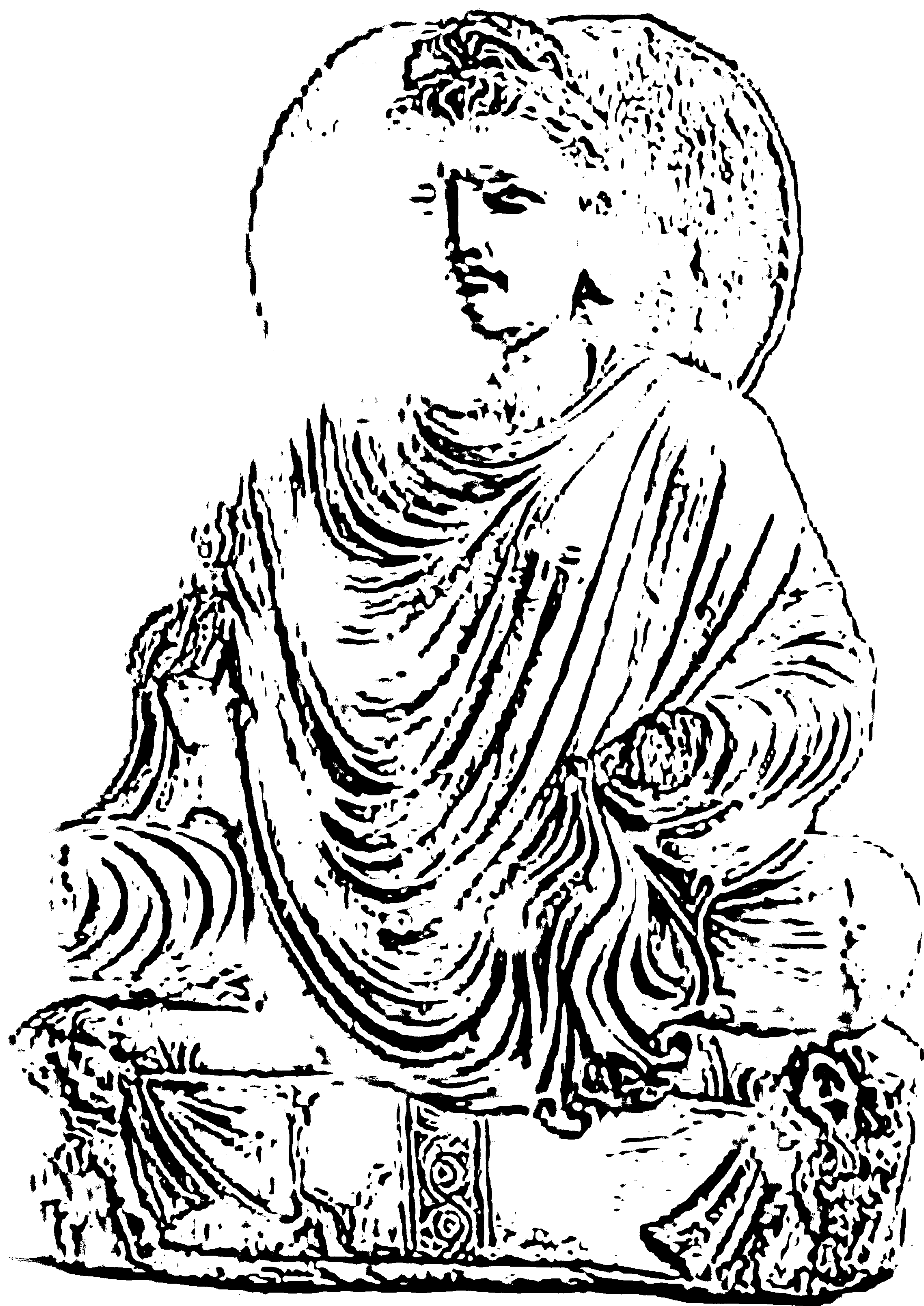
A Gandhara Buddha from Takht-i-Bahi See page XI