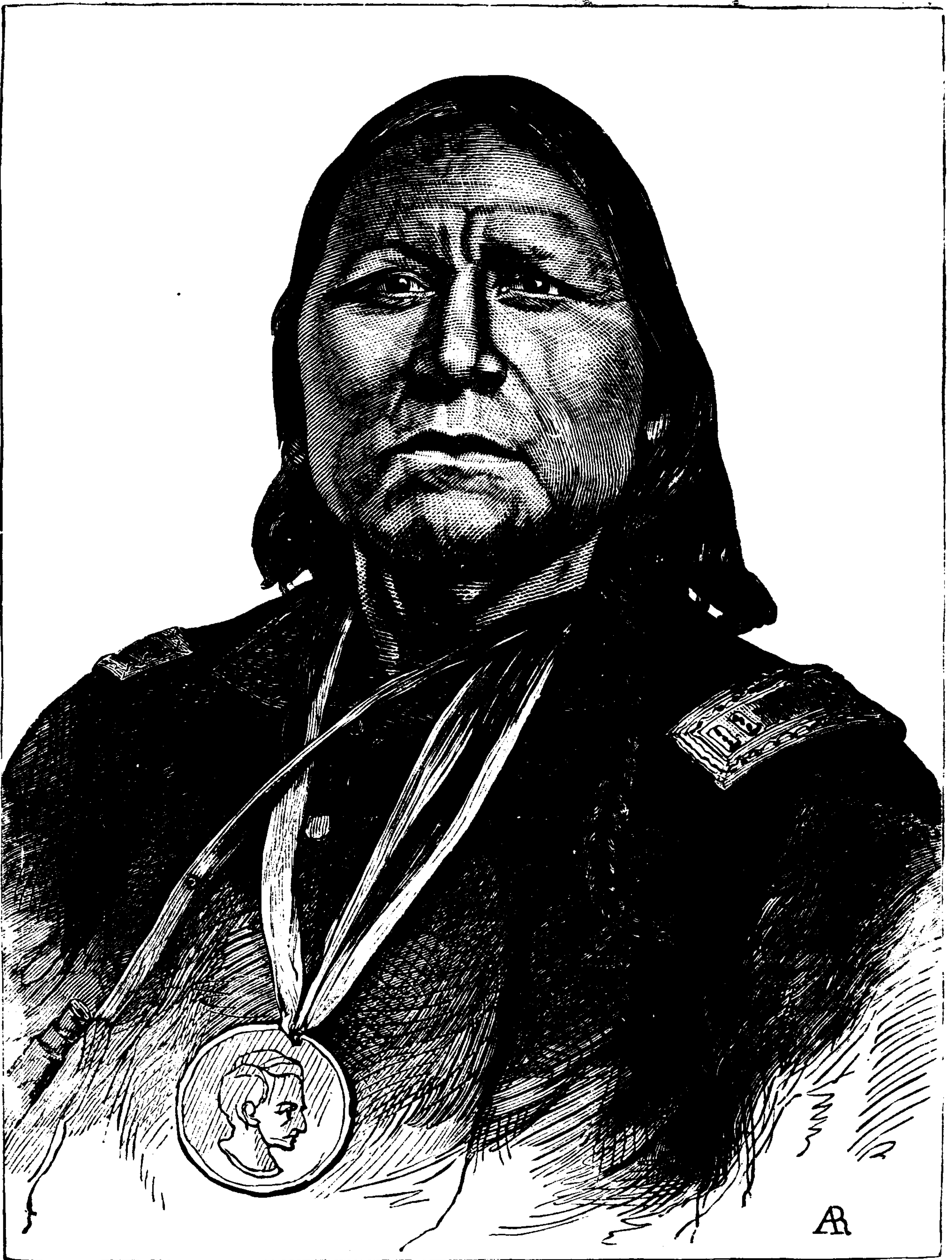
SATANTA, SECOND CHIEF OF THE KIWAS.