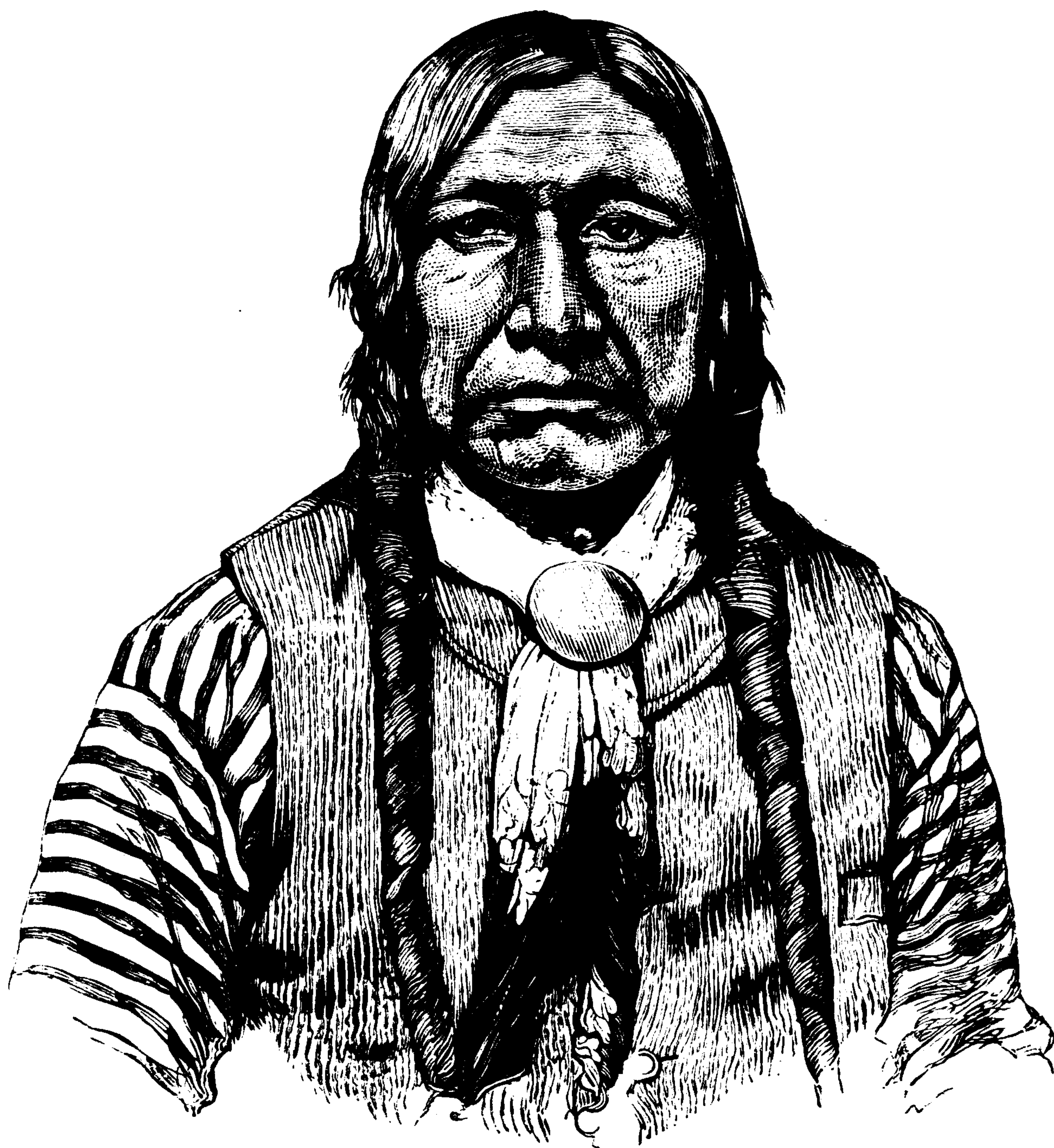
YELLOW BEAR, SECOND CHIEF OF THE ARAPAHOES.