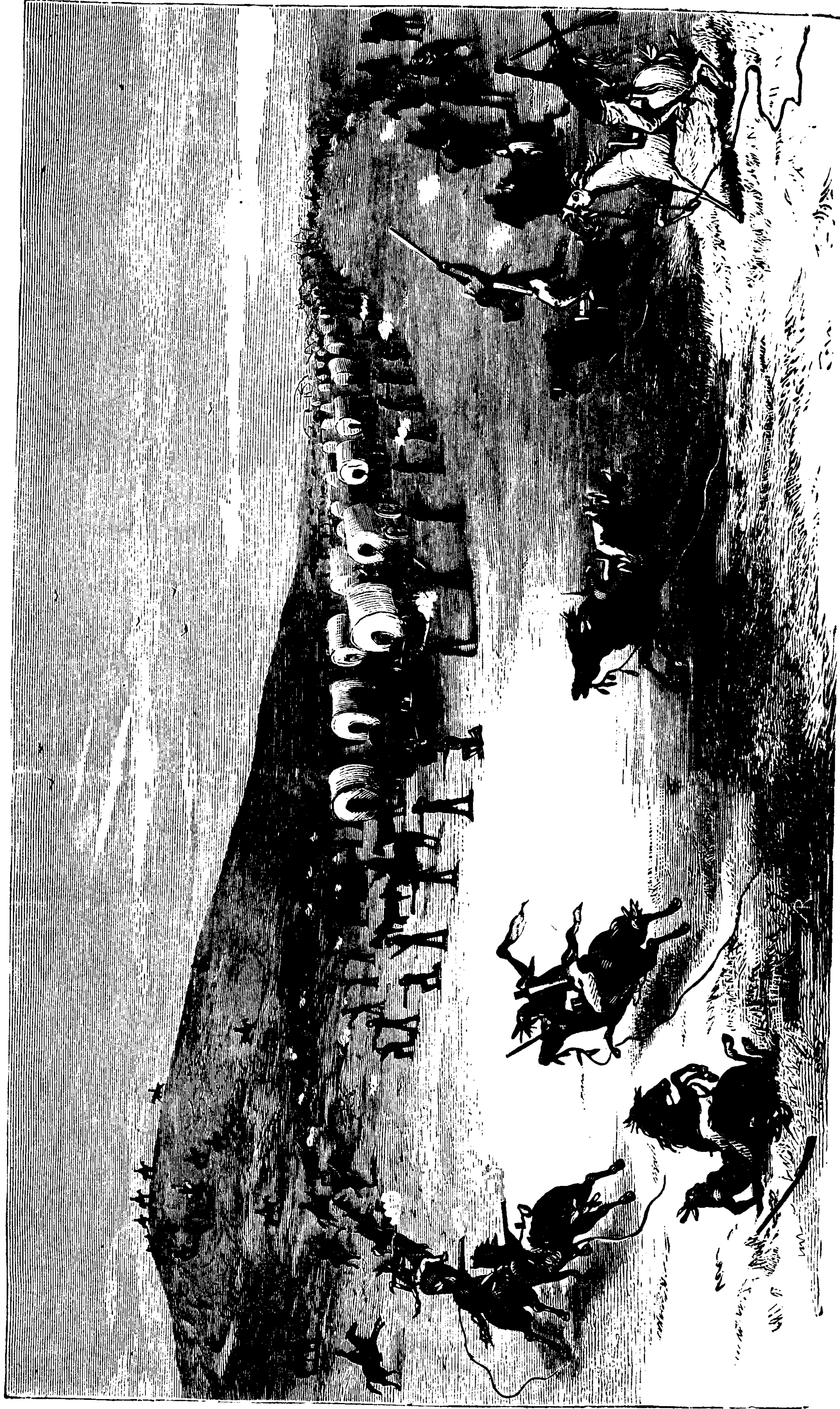
THE ATTACK UPON THE TRAIN.