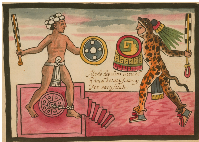
Figure 3. 'Gladiatorial' sacrifice, from the Tovar Codex , c.1585 [Library of Congress, Jay I. Kislak Collection].