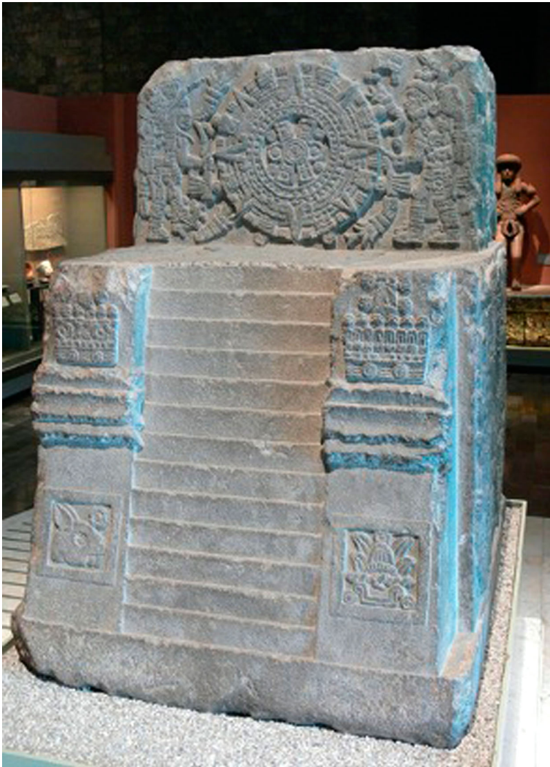
Figure 6. Teocalli of Sacred War, Museo Nacional de Antropología, Mexico City [Wolfgang Sauber via Wikipedia Commons, CC-BY-SA 3.0].

The link between religious and political power is made explicit in a magnificent stone monument which was discovered in 1831 near the palace of Moctezuma II in Mexico City (Figure 6). Variouslly called the 'Monument of Sacred War', 'Monument of Holy War, the Teocalli (temple, lit. "god/divine power house") of Sacred War', or the 'Throne of Moctezuma II', the stone chair probably commemorates the Xiuhmolpilli ('Binding of Years')