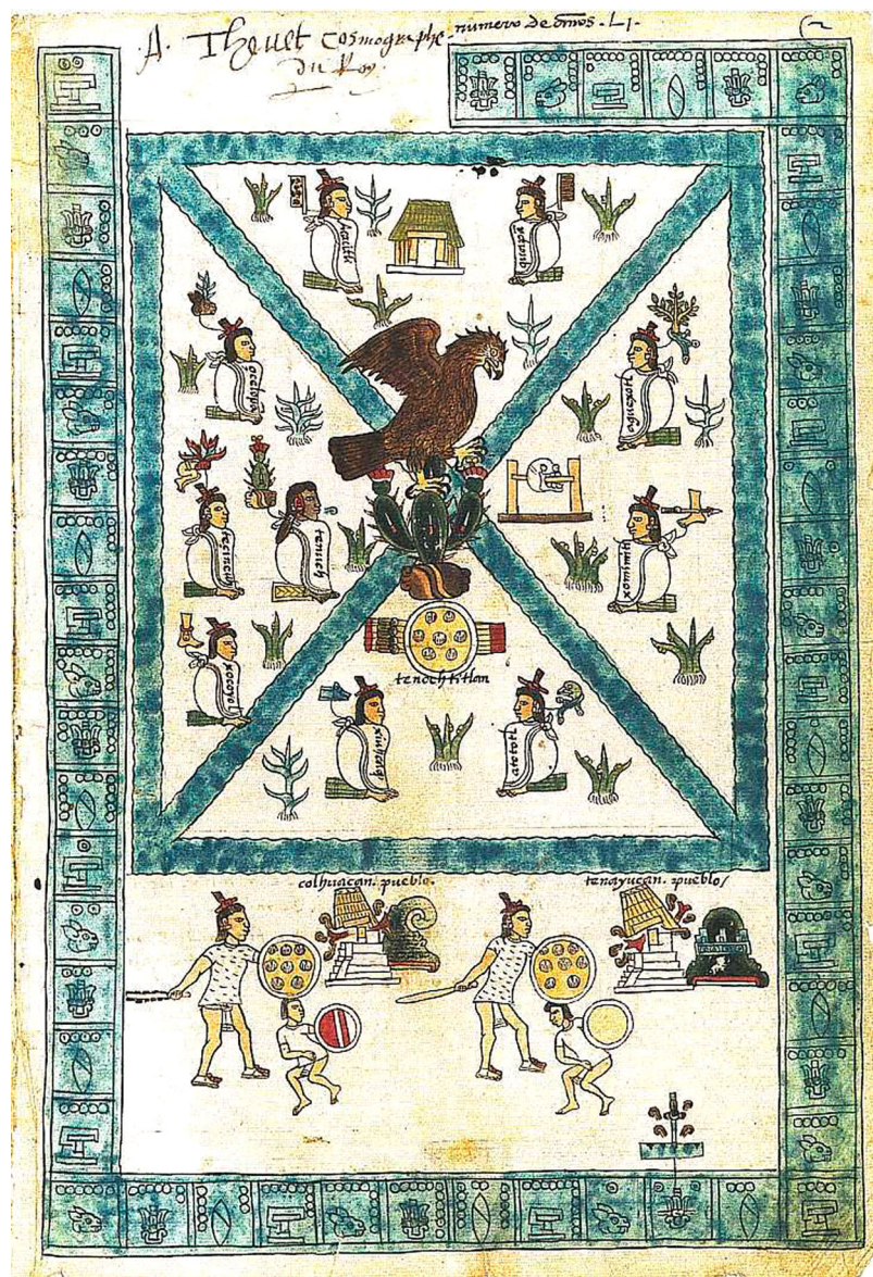
Figure 1. The foundation of Tenochtitlan, from The Codex Mendoza , c.1541, fol. 2r..

throughout Aztec belief. And, if we look beyond everyday domestic practice to explicitly ritual behaviours, it becomes clear how deeply rooted were pervasive military convictions.