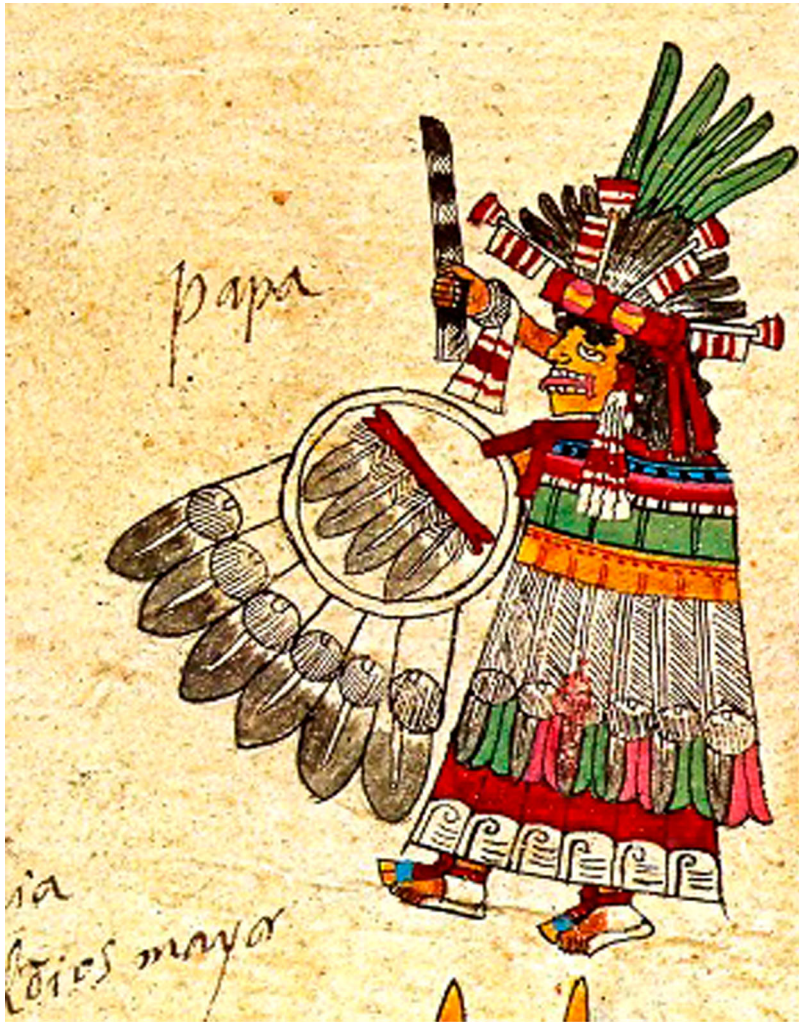
Figure 4. Cihuacoatl holding shield and weaving batten, from the Codex Borbonicus , f. 23, c.1520.

The use of batten as weapons was not merely figurative; female implements also possessed metaphysical power which could be deployed in the real world. In 1473, during the civil war between Tenochtitlan and its 'twin' city of Tlatelolco, the desperate Tlatelolcan women went into battle themselves. Some stripped naked, carrying traditional shields and obsidian-bladed clubs, and squeezing milk from their breasts to sprinkle on their assailants. Others threw up their skirts to show their buttocks to the enemy, or threw brooms and weaving implements at their enemies: batten, frames, brooms and spindles rained down on the Tenochca warriors. This would undoubtedly have embarrassed the Aztec men, but also shows the practical use of sacred power in battle. These objects, profoundly infused with spiritual significance, brought women's primal force to bear on the battlefield. The juxtaposition of women's tools – symbolic objects of femininity – with the aggressive display of female sexuality is striking: this was a frantic (and ultimately