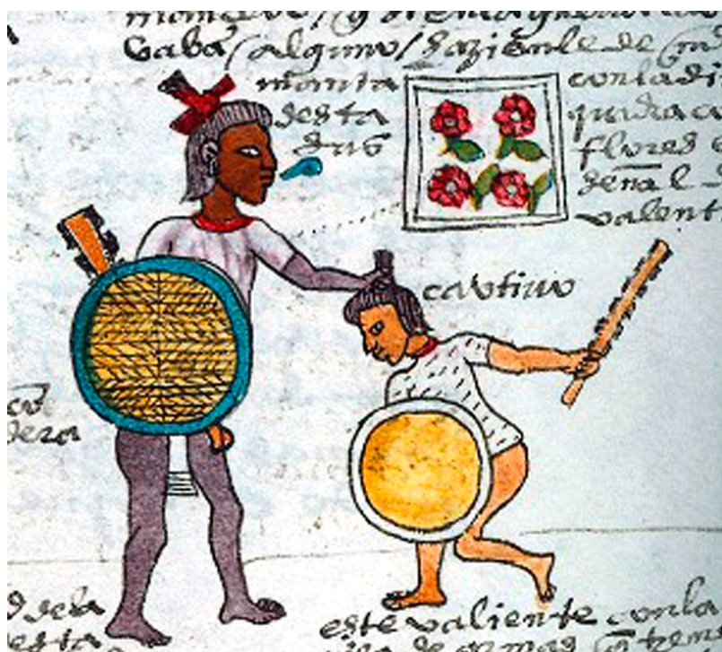
Figure 5. A youth takes his first captive, from the Codex Mendoza , c. 1541, f. 64r.

64r-65r; Sahagún [c.1575–77] 1979b, 56, 65; Zorita [1585] 1971, 267; Hassig 1988, 37–47) – but the entire system was underpinned by the explicit aim of securing victims for human sacrifice. Single combat was certainly seen by the Aztecs as the ideal form of battle – this was a culture of individualism which valorized displays of personal skill – but capture rather than kill only makes sense as part of military efforts if one prioritizes the sacred dimensions of warfare over the purely pragmatic.