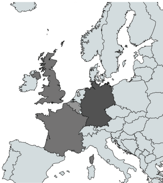
Figure 1. Western European countries covered in this contribution: Belgium, France, Germany, and the UK.

The Westphalian settlement (1648), in retrospect, set in motion a trajectory that would pass through ideas of religious tolerance, state neutrality, and privatised religion. Along with developments resulting from the growth of modern capitalism and the early modern