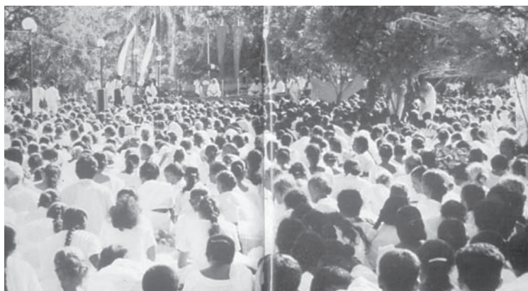
Sarvodaya Peace Meditation.

Once participants have begun developing their own personal peacefulness, they are asked to spread that peacefulness around. As the second and third actions for removing popular support for violent acts, Sarvodaya urges participants to ask everyone they know (2) to stop violence and to stop supporting violence and (3) to speak against violence