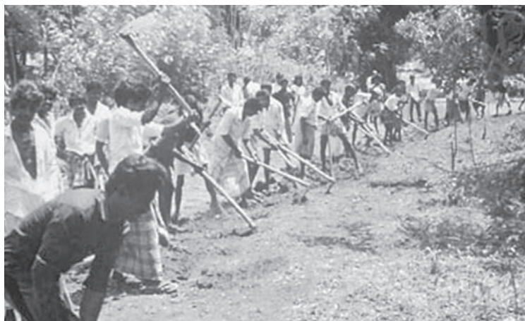
A Shramadana—Building a Road.

Once a decision has been made, a work camp, or shramadana (which means “giving labor,” with all the Buddhist connotations of the meritorious nature of giving), is organized. At the shramadana all the villagers are again invited to participate by giving their labor to the village as a whole. They work together in teams, and by the end, all who have participated know that they have with their own hands produced a valuable addition to the village. They did not wait for the government or experts or anyone else. That is empowering. They begin to see themselves as people who can do things. Thus, as we noted above, one of the favorite slogans in Sarvodaya is “We build the road, and the road builds us.” The road building the villagers is actually the more important of the two; it contributes to the development of each participant and to the building of new relationships among the villagers.