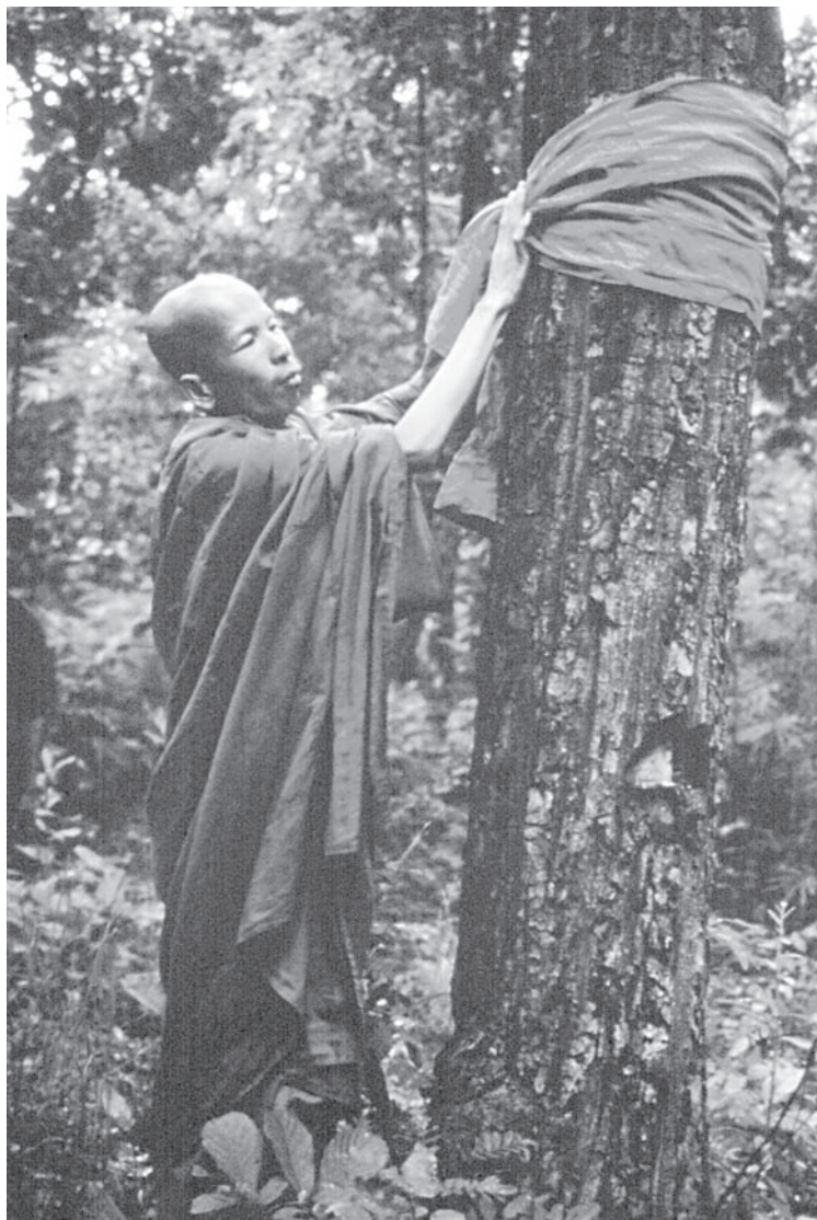
Tree Ordination, Thailand.