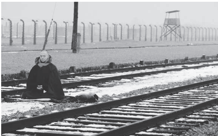
Zen Priest on Retreat at Auschwitz-Birkenau.

While participants were invited to bear witness in a spirit of “not-knowing” what the outcome of that witness would be, Glassman felt sure that some kind of healing would develop out of the experience of