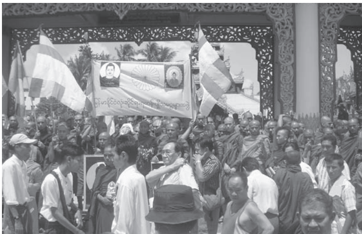
Burmese Monks Protesting against the Government, 2007.