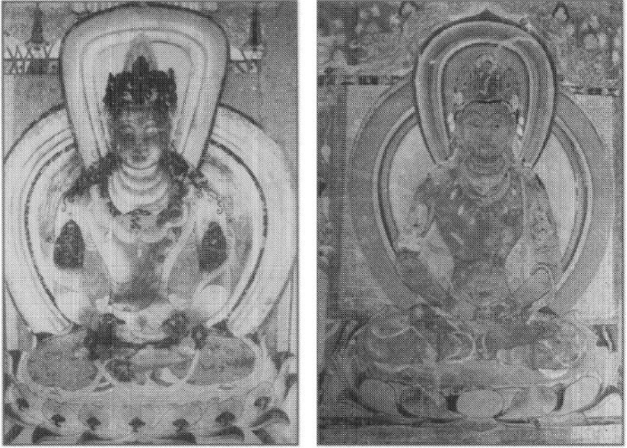
Figure 4.2 Left: Vairocana, Anxi Yulin cave 25 (after Anxi Yulinku). Right: Vairocana, Dunhuang cave 14 (after Dunhuang Mogaoku).