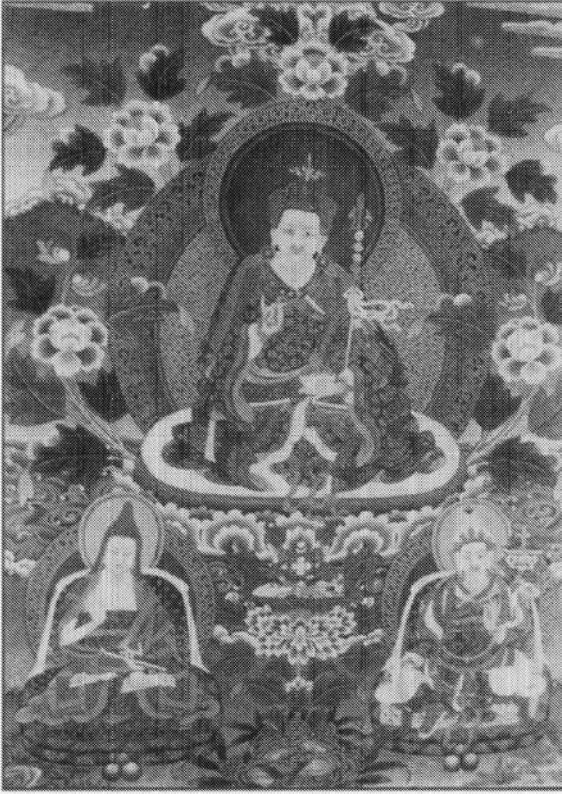
Figure 3.1 The trinity of the Tibetan conversion: Padmasambhava ( center ), Śāntarakṣita ( lower left ), and Trhi Songdetsen ( lower right ). Nineteenth century (after Bod-kyi thang-ga ).

nese in the conversion of Tibet, accentuated by the Testament of Ba , is now mostly effaced, and it is no accident that this occurs while China's Mongol emperors of the thirteenth and fourteenth centuries hold at least nominal sway over Tibet. 68 Indeed, in later times the Chinese monks who had come to Tibet would be caricatured as buffoons. In the narratives of the foundation of Samye, too, the old ministerial clans are either forgotten altogether or receive a poor second billing after the legendary adepts of Padmasambhava's immediate circle. 69 Thus even the Testament of Ba , a work that seems to have nothing but praise for the great master, ultimately comes to be disparaged by later adherents of his cult, not for its inconsistencies, but because it is thought to represent the "sullied perspective" of the ministers. 70 The transformations noted here in the tale of the mark of vermillion thus may serve to delineate a general and thoroughgoing transformation of Tibetan historical consciousness.