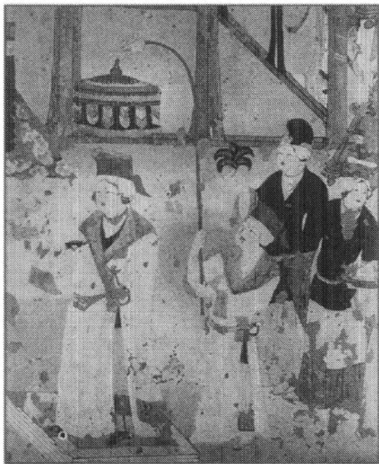
Figure 4.1 Dunhuang cave 159. A Tibetan Tsenpo in the lower register of a mural depicting the bodhisattva Vimalakīrti as its main theme. Late eighth–early ninth century (after Dunhuang Mogaoku ).

in a manner that could be understood not only within Central Tibet, but among subject populations and in neighboring realms. 52 That something along these lines occurred is most clearly in evidence in connection with the esoteric cult of the Buddha Vairocana, to which we now turn.