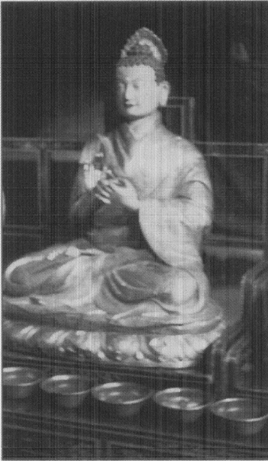
Figure 6.1 Sakya Paṇḍita. Sixteenth century. Now preserved at the Nyingmapa monastery of Mindröling.

istic outlook that he encouraged in his religious dealings with the Mongol empire. Dölpopa, in contrast to both, emphatically privileges particular texts and doctrines within the great corpus of Indian Buddhist scriptures and finds in the contemplation of their inner meaning the key to the understanding of the Buddha's teaching overall. 11