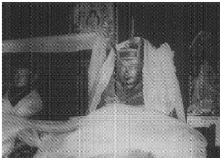
Figure 8.2 Above: Songtsen Gampo, the Buddha Amitābha emerging from his turban, and accompanied by his Chinese and Nepalese queens. Modern representation at the chapel of Songtsen's mausoleum in Yarlung valley. Below: Padmasambhava in the revered image from Yarlung Sheldrak, the Crystal Peak of Yarlung, where the treasures of Orgyen Lingpa were recovered (see chapter 9).