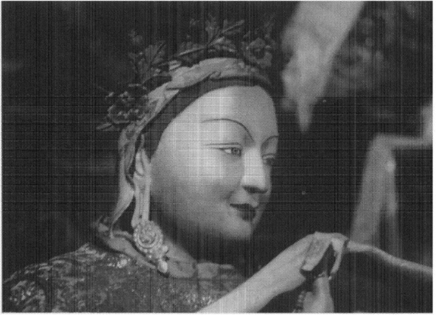
Figure 2.1 Above: The Jowo Śākyamuni statue in the central shrine of the Lhasa Jokhang Temple. Below: The Chinese princess of Wencheng as enshrined in the Jokhang.