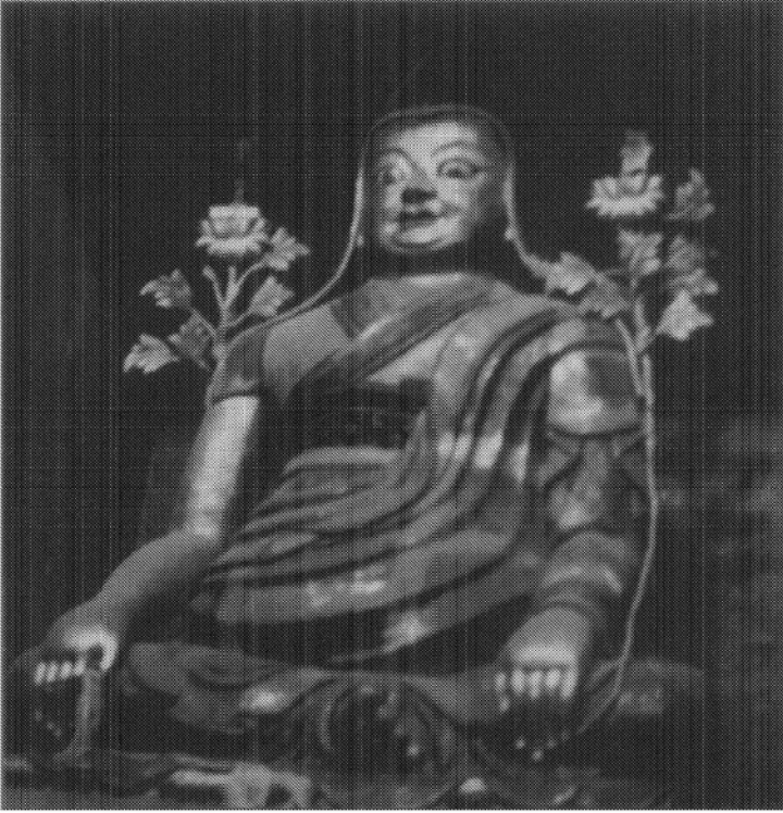
Figure 6.2 Dölpopa. A modern image at Se Monastery in Sichuan.

Or almost none. It is clear, for instance, that the authors of philosophical commentaries in Sanskrit often had knowledge of the earlier commentarial history of the texts with which they were concerned. That is to say, they knew, more or less, the chronological sequence in which the earlier commentaries were composed, and who it was that was refuting or defending whom. So, for instance, Candrakīrti on Buddhapālita and Bhāvaviveka. 111 But we may point, too, to other examples: Haribhadra's references to the earlier commentarial tradition of the Abhisamayālaṃkāra (The Ornament of Emergent Realization), 112 for example, or Yasomitra's to that of the Abhidharmakośa (The Treasury of the Meta-Doctrine). 113