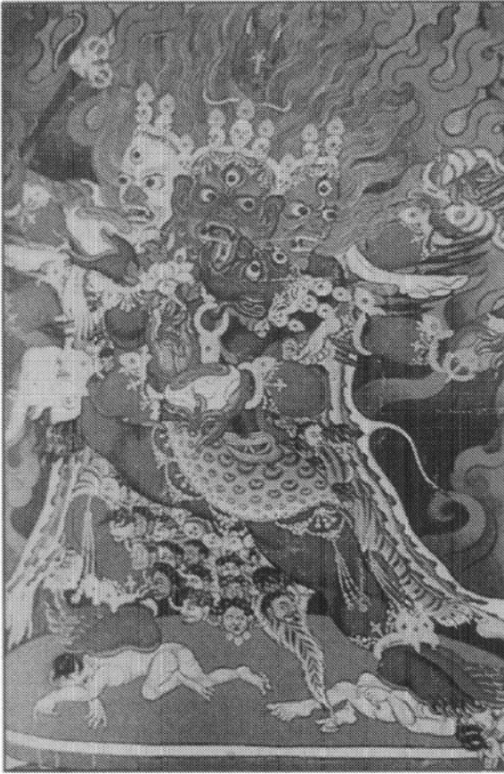
Figure 9.2 The wrathful Hayagrīva, a small horse's head protruding within his flaming hair. A recent thangka painting.