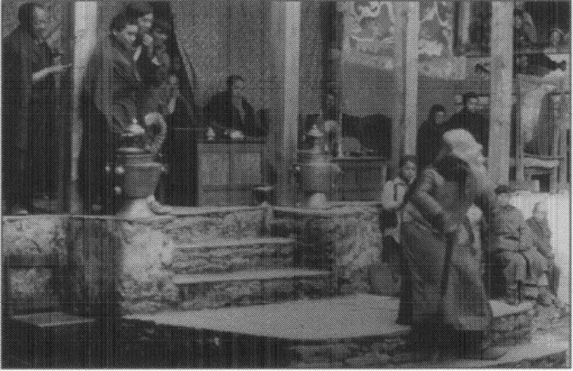
Figure 3.2 Mi-tshe-ring, the “long-life man,” derived from the Chinese god of longevity Shouxing, is a buffoon figure in monastic dance-dramas. He is popularly (though incorrectly) identified with the eighth-century Chan master Moheyan, and so has come to represent the Chinese false teacher.