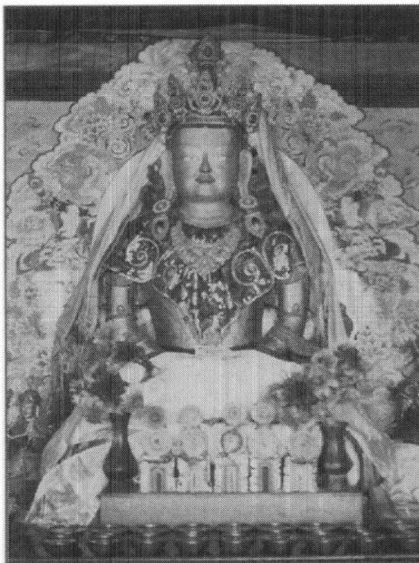
Figure 9.1 Samantabhadra in the form of the body of rapture ( Sambhogakāya ). A modern statue at Mindröling. The iconography merits comparison with that of the imperial-period Vairocana (see fig., p. 64).

with Samantabhadra. When such an introduction takes place, the goal of the path may be realized almost immediately. As the Tibetan poet-saint Milarepa (1040–1123) was told by his Nyingmapa teacher Rongtön Lhaga: