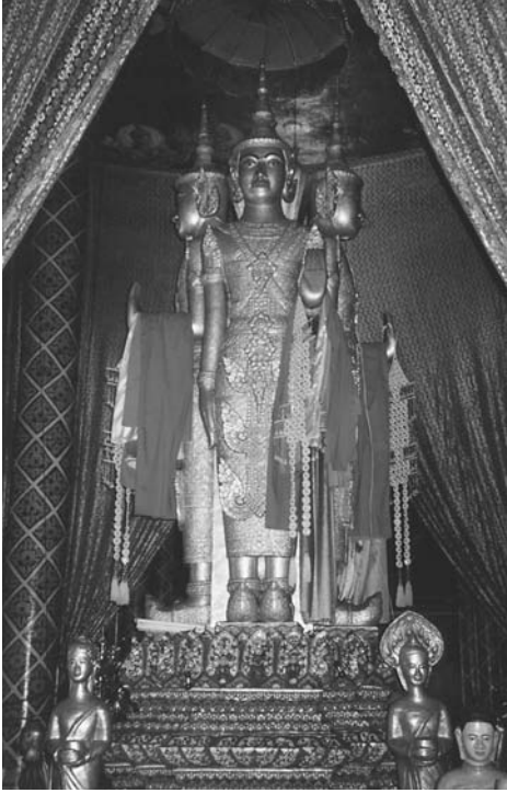
(left) Arrangement of four standing Buddhas—Wat Tralaeng Kaeng, Longvek, Kompong Tralach District, Kompong Chhnang Province.