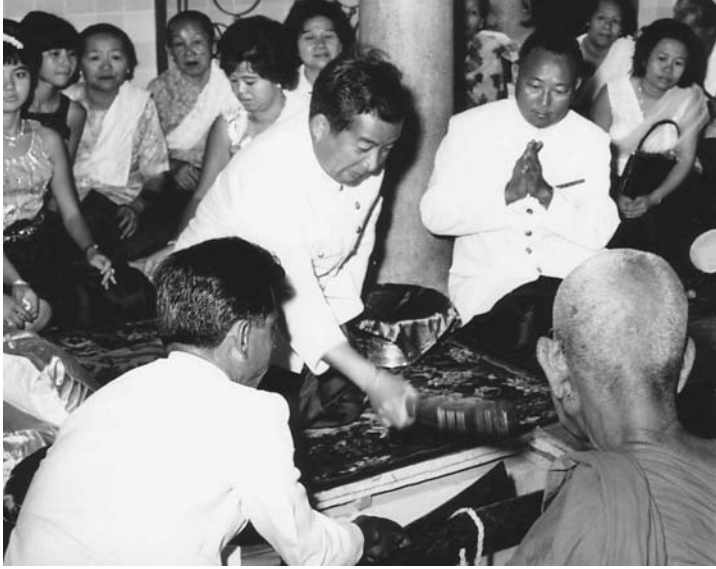
Prince Sihanouk, cutting indrakhila —Wat Ang Chum, Kompong Speu Province, February 10, 1968.

Similar royal foundations have continued into the modern period. Thus Wat Koh, Kien Svay District, Kandal Province, was founded by Sisowath's favorite wife, the king himself participating in the boundary ( sīmā ) demarcation ritual (Meas-Yang 1978, 44).