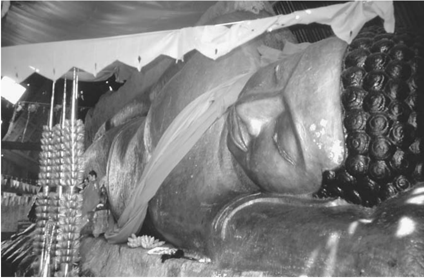
Preah Ang Thom—Phnom Kulen, Svay Leu District, Siem Reap Province.