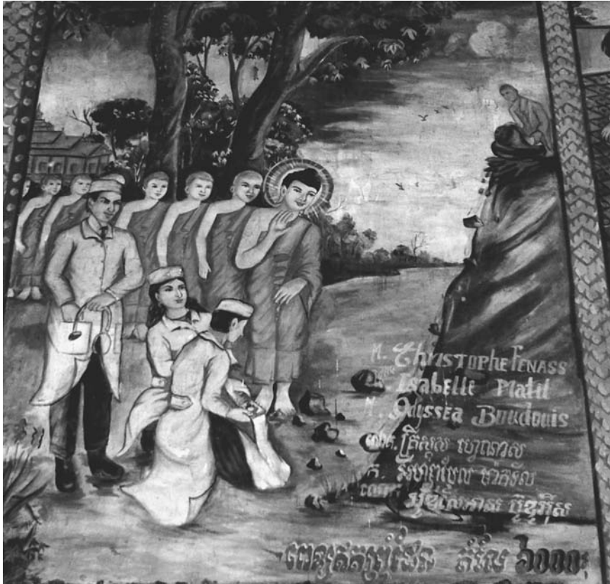
Traditional mural of the Buddha after being attacked by Devadatta. Less traditionally, he is tended by named Western patrons—Wat Kompong Thom, Kompong Thom Province.