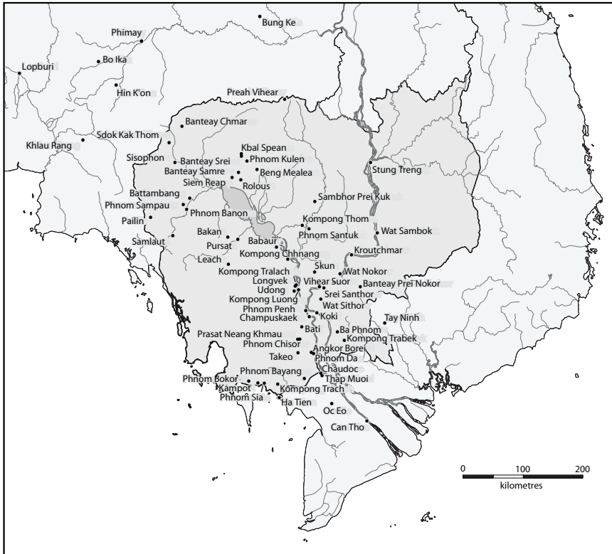
Map of Cambodia.

forging of a unified identity in the expanding polity that emerged in the lower Mekong region in the early centuries of the Christian era.