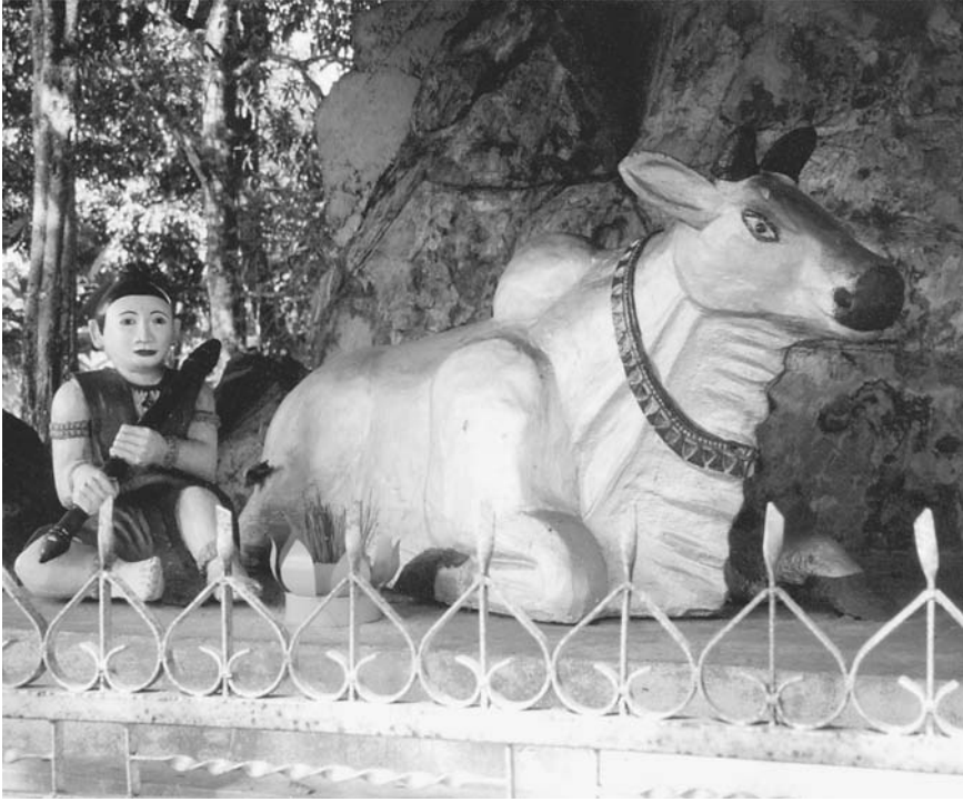
Shrine of Preah Go and Preah Kaev—Chhlong District, Kratie Province.