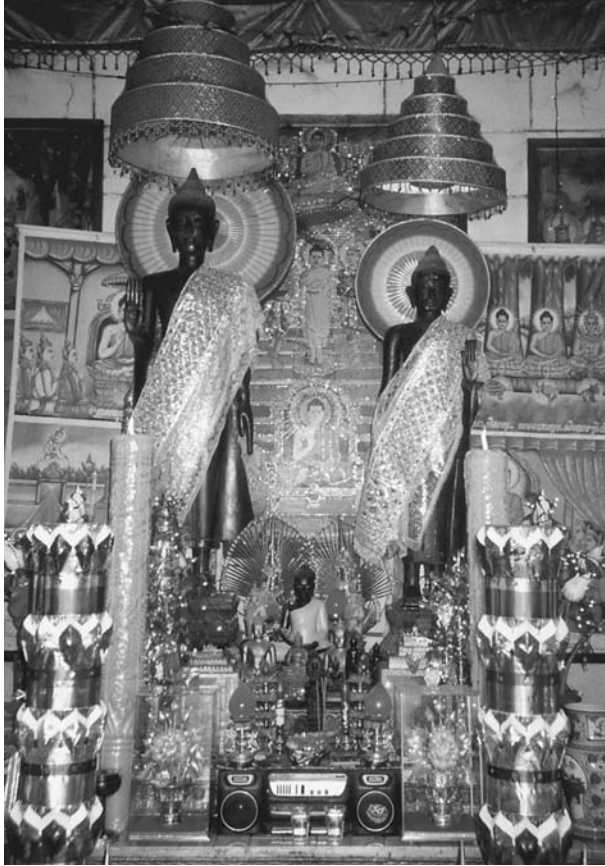
Shrine of Neak Tà Khleang Moeung, Bakan District, Pursat Province.

that many of the customary motifs of monastery art were already present in Cambodia in the seventeenth and eighteenth centuries. Carved wooden panels from Babour now in the National Museum in Phnom Penh, for example, depict the Buddha's conception and various sylvan deities ( yakkha ), as well as scenes from the Rāmāyaṇa and the Jātakas (Giteau 1975, 209–214). 75 Today the interiors of most vihāras are painted with narrative depictions. They may also have murals on their outer walls. 76 The interior walls generally illustrate key incidents from the life of the Buddha. It is particularly common to find the defeat of Māra ( māravijaya ) immediately behind the altar. Depictions of the Buddha's previous lives, as recorded in the 547 stories of the canonical Jātaka collection, are also frequent. Particularly common are the final ten ( dasajātaka ),