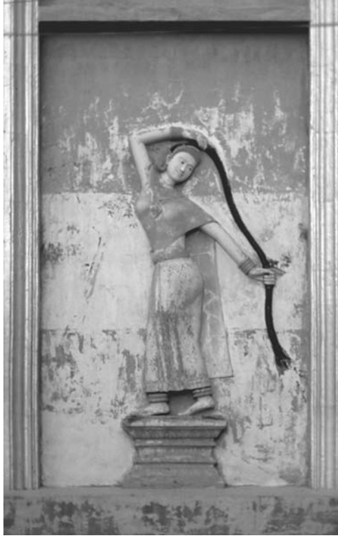
The earth goddess, Nang Thorani—Wat Buddhaghosa, Phnom Penh.