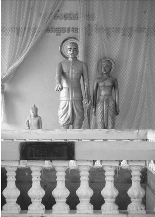
Shrine of Preah Nang Cek and Preah Nang Cam, Siem Reap city.

is known that ritual suicide and probable human sacrifice were linked to goddess cults practiced in the Indian Pallava kingdom of the seventh through ninth centuries. It is possible that such rites were exported to Cambodia, for the last human sacrifice in the country took place at Ba Phnom in April or May 1877 20 when two prisoners of war were beheaded during a royally sponsored ceremony of “raising up the ancestors” ( loeng neak tā ), a festival still held in a highly modified form at the beginning of each growing season. It is significant that the rite occurred in pisakh , the month sacred to Kālī, the Brahmanical deity most particularly associated with neak tā Me Sa. Indeed, the human sacrifice