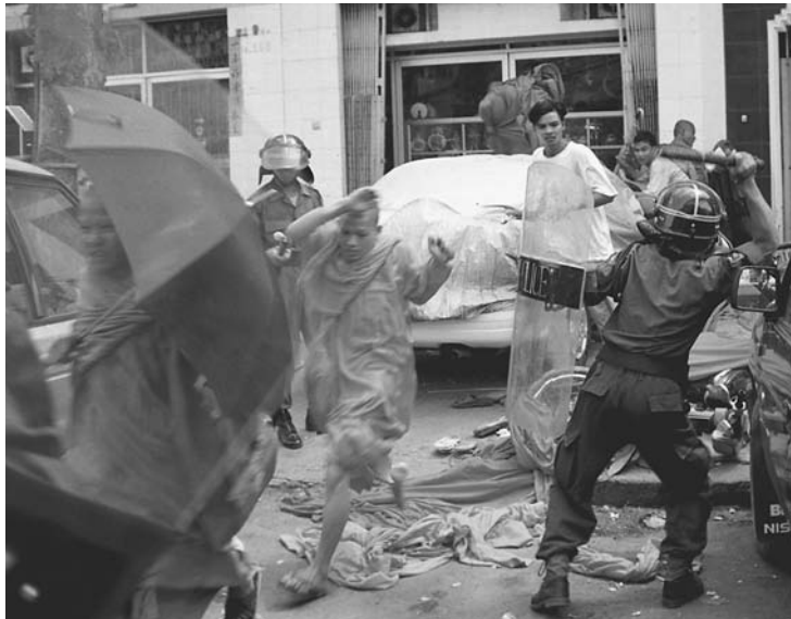
Police officers attacking young monks near Central Market, Phnom Penh—September 8, 1998.