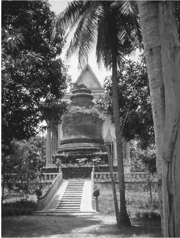
Great stūpa —Wat Sithor, Srei Santhor District, Kompong Cham Province.

Prampil Lvaeng and Tang Tok, both at Angkor Thom, and Preah Theat within the precincts of Wat Unnalom in Phnom Penh.