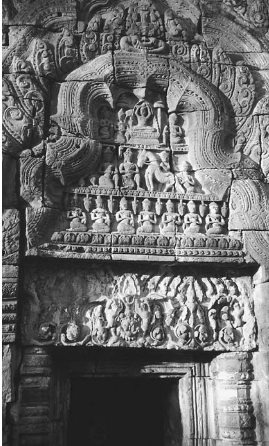
The future Buddha, cutting off his topknot—southern pediment of central prasad ; Wat Nokor, Kompong Siem District, Kompong Cham Province.

was the focus of significant attention (Thompson 1999, 164n63). With these facts in mind, Ashley Thompson has suggested that some post-Angkorian stūpas of the sort mentioned above were connected with the Maitreya cult. At Wat Nokor, four Buddha figures were arranged so that they faced out from the four antechambers of the cruciform structure. Similar configurations may be found in adjacent chapels (Thompson 2000, 246–247). The pattern also occurs at Angkor Wat, where the four doorways of the central tower were closed with sandstone blocks carved with images of standing buddhas at around the same time. Contemporary residents regard these images as representations of the