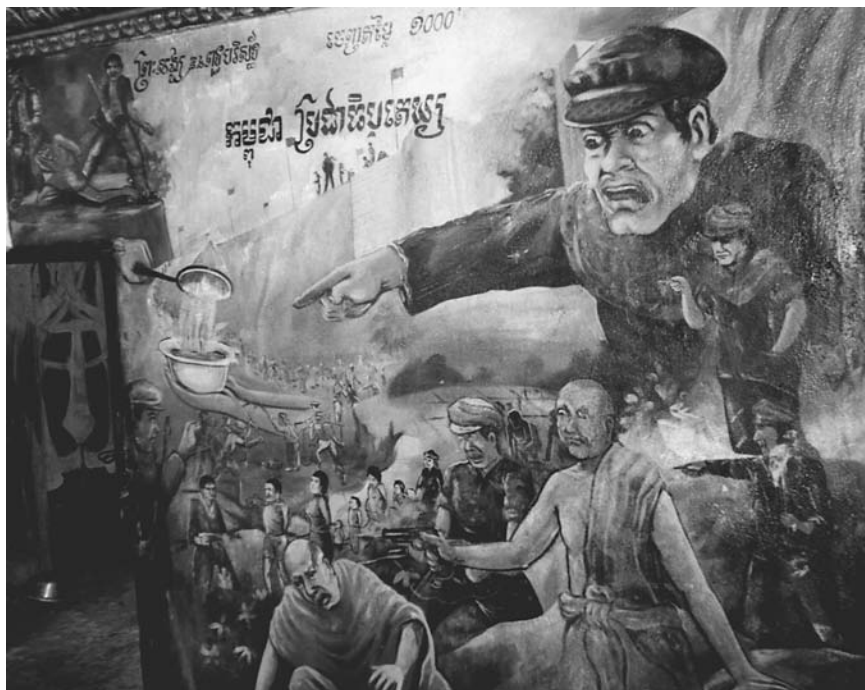
Mural of Khmer Rouge hell—Wat Kompong Thom, Kompong Thom Province.

seems that the practice of the unified order was oriented around Mahanikay interpretations of monastic discipline ( vinaya ). 16