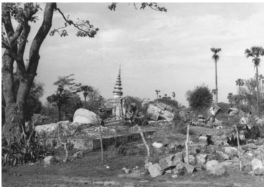
(below) Ruined monastic library—Wat Krapuchaet, Kandal Province, early 1980s.