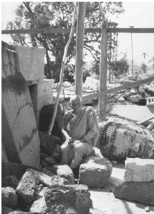
(left) Heavily damaged pagoda (unidentified)—early 1980s.