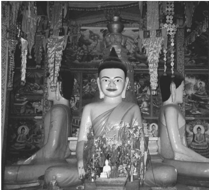
(below) Arrangement of four Buddhas—Vihear Yiey Peou, Wat Nokor, Kompong Siem District, Kompong Cham Province.