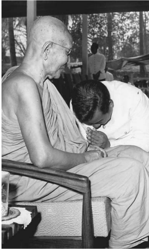
Prince Sihanouk and Ven. Chuon Nath—Wat Kompong Thmar, Kompong Thom Province, March 28, 1968.