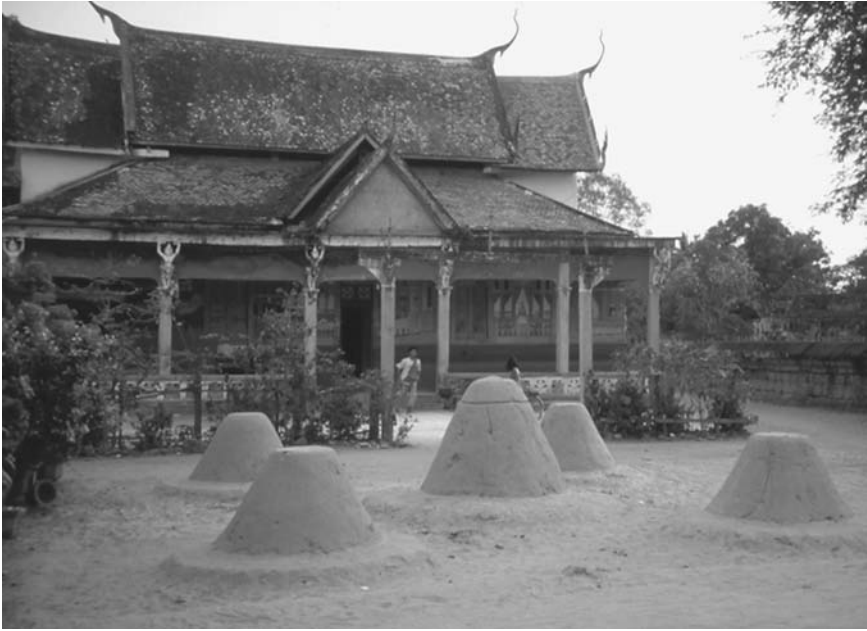
Cosmologically significant sand mounds ( phnom khsac ), constructed as part of traditional New Year festivities—Wat Bakong, Prasat Bakong District, Siem Reap Province.