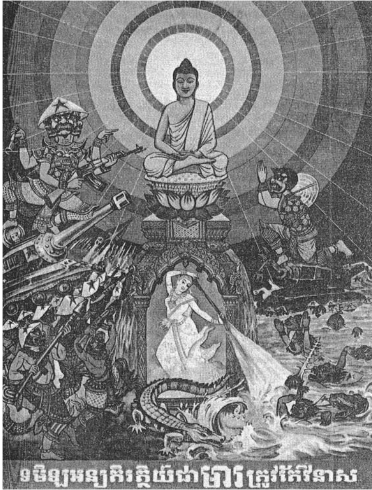
The earth goddess, Nang Thorani, destroying Vietnamese troops, who are represented as the horde of Māra—Phnom Penh wall poster, February 1972.

pulled over her left shoulder. This distinctive iconography cannot be traced to Indian or Sri Lankan sources but seems to be based on the Pali Paṭhamasambodhi , an anthology of biographical accounts of the Buddha's life known only in Southeast Asia. The image is old, as carvings at Beng Mealea, Ta Prohm of Angkor, and Ta Prohm of Bati, all dating to the twelfth century, testify. 27 The traditional account of the Buddha's enlightenment also tells how Nang Thorani emerged from the soil after Māra's daughters failed to excite the Buddha's